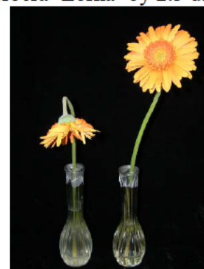
Control ClO 2